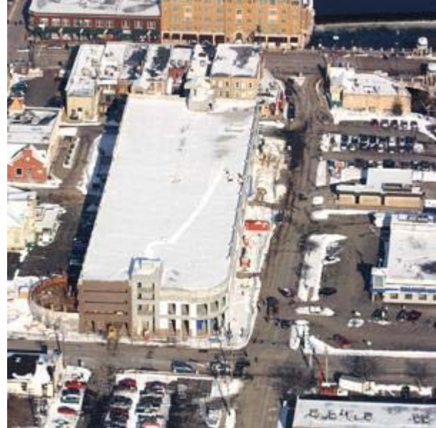
First street Project downtown St. Charles. West Main Street (top) Walnut St. (left to right bottom).